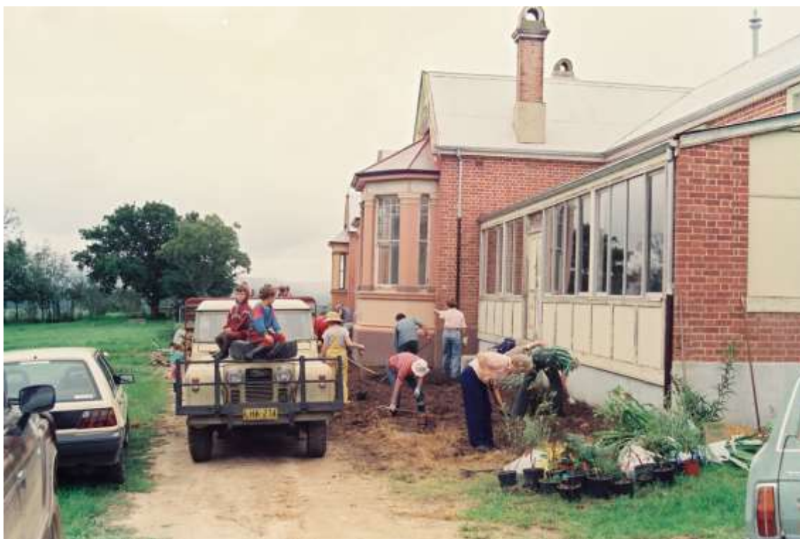
Photos: The 1988 conversion of the derelict main building to a community centre. Above, landscaping. Below, window restoration workshop. More photos are on the OBH website .