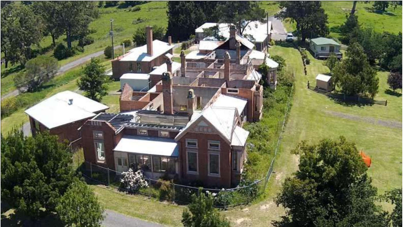
The Old Bega Hospital as it is today. It sits in a 1.6 ha Crown land site on the outskirts of Bega.