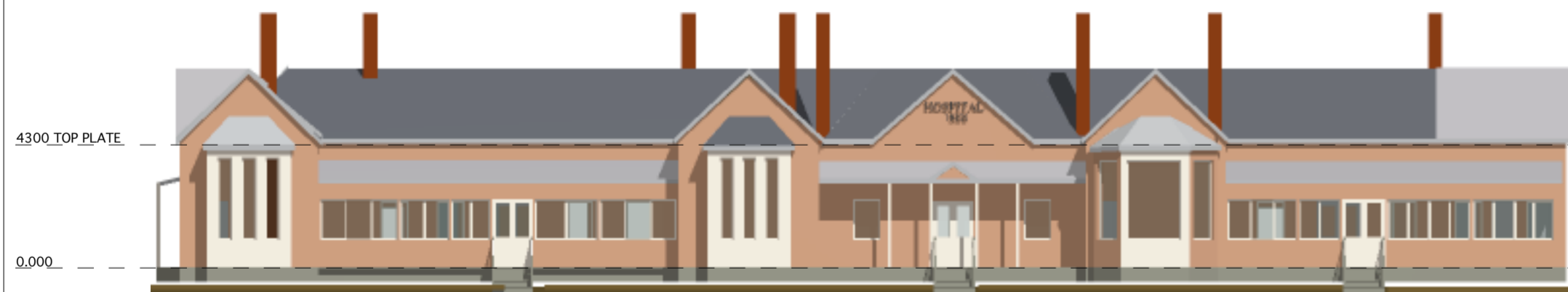
SOUTH ELEVATION 1:200