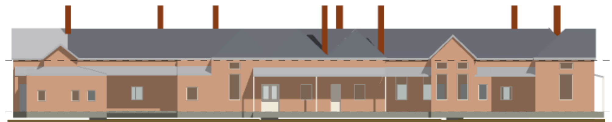
NORTH ELEVATION 1:200