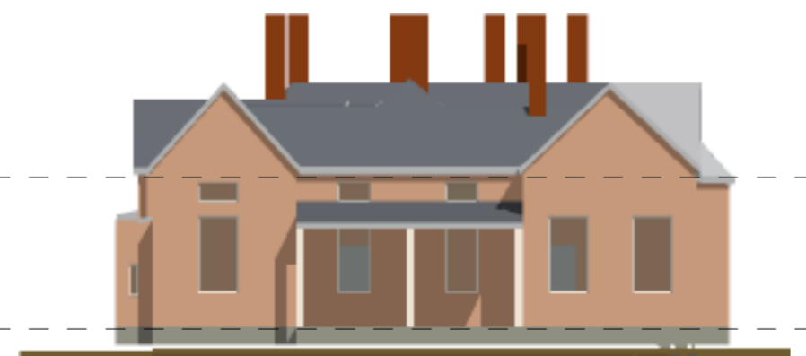
WEST ELEVATION 1:200